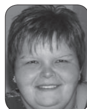
PRODUCTION Nicole Kapusta

The Winkler Morden Voice is published Thursdays and distributed as a free publication through Canada Post to 15,000 homes by BigandColourful Printing and Publishing.