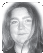
PRODUCTION Tara Gionet