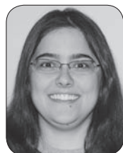
EDITOR Ashleigh Viveiros