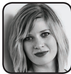
By Candace Hamm

SD: Eligibility is determined solely based on income and financial need,