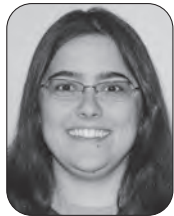
EDITOR Ashleigh Viveiros