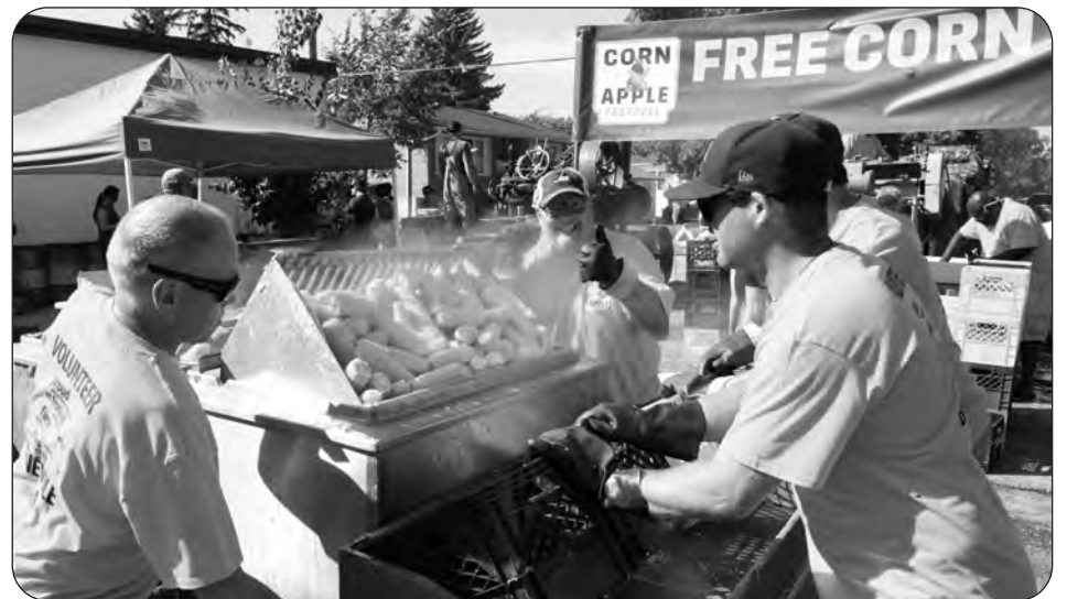
VOICE FILE PHOTO

The Friday evening lineup, meanwhile, features a headline performance from Canada's premier Eagles tribute act Epic Eagles.