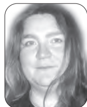
PRODUCTION Tara Gionet