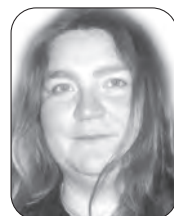
PRODUCTION Tara Gionet