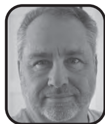
By Peter Cantelon

scribed uncharitably as a morph of the eastern grey squirrel or southeastern fox squirrel, I prefer to think of them as a singular species all to their own and the dominant overlord of all squirreldom.