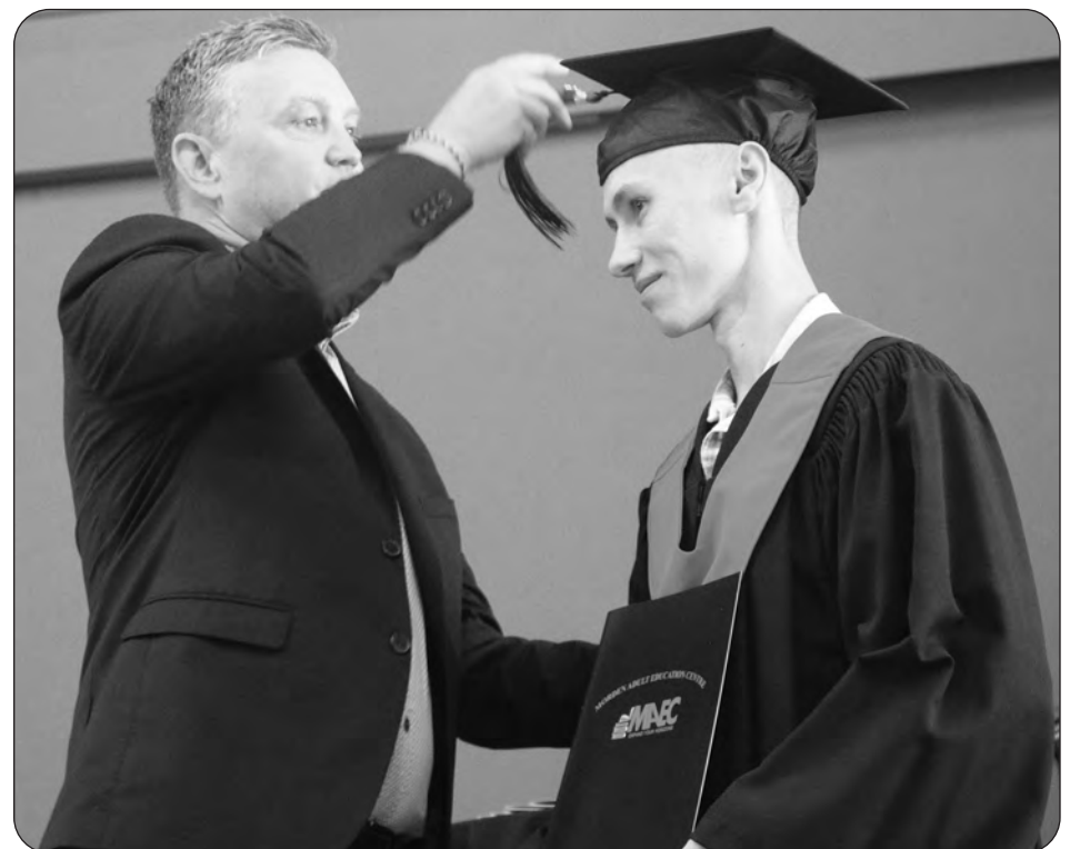
The Morden Adult Education Centre celebrated its 2025 graduates Monday afternoon.