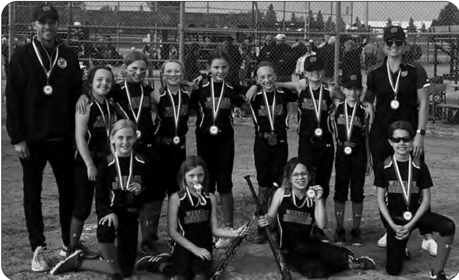
Clockwise from left: The Winkler Nitro, Golden Gloves, and Dynamite U11 softball teams won gold, silver, and bronze, respectively, in the regional playdowns.

Golden Gloves in the championship final, taking that one 8-5 for the medal. The Gloves, meanwhile, had bested Bruxelles HT 13-0, Carberry, 16-1, and MacGregor 10-0 to earn a seat at the championship game. On the path to their bronze medal win, the Dynamite defeated Rock Lake 7-3 before falling 9-4 to Notre Dame to end up on the B-side, where they beat Carman 6-2, Glenboro 17-16, and finally Rock Lake once again 10-8 to secure the third-place finish.