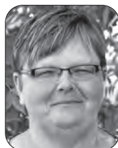
PRODUCTION Nicole Kapusta