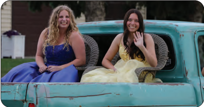
Winklerites lined the streets last week Wednesday to celebrate the graduates of Garden Valley and Northlands Parkway collegiates as they took part in the annual grad parade through town. Both high schools hold their grad ceremonies this week.